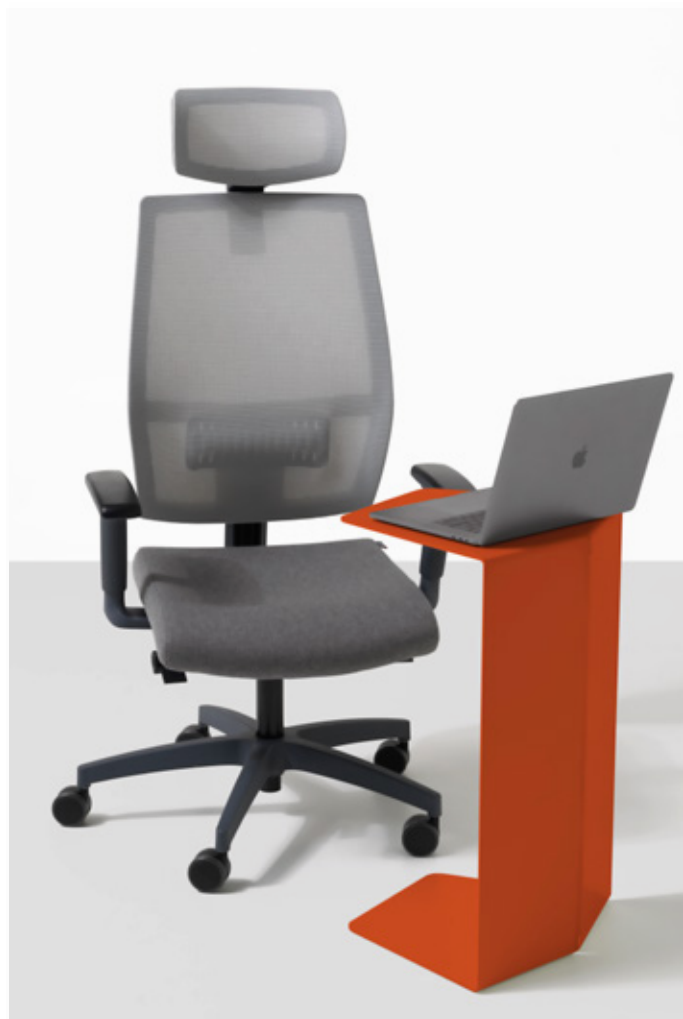
Mesh 8043 - Wolin 7050.22