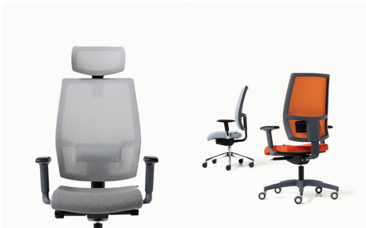
Mesh 8043 - Wolin 7050.22 / Wolin 7050.03 / Mesh 3029 - Wolin 7050.36

Balanced proportions and formal dynamism distinguish the design of the LEAD chair. The mesh or fully upholstered backs make for a striking visual impact and enable LEAD to blend in to all manner of settings. The wide range of optionals includes a headrest, and height and depth-adjustable lumbar support.